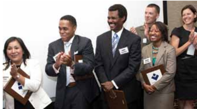
Left Class of 2011 at the Opening Retreat